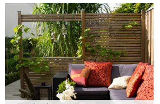
Example of #26-28