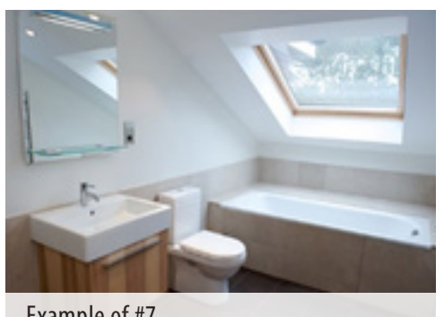
Example of #7